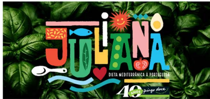
Figure 2. Juliana's design ( https://juliana.pingodoce.pt/ )

From the first editions, the covers of SB have the following layout: at the top the title, underlined by its slogan, Faz Bem (is good for you); at the bottom, on the left, the drawing of an olive tree, with the caption Sabores Mediterrânicos (Mediterranean flavors) and, on the right, the PD supermarket logo. The first year of the COVID-19 pandemic, 2020, was also the year of the PD's 40th anniversary celebrations. As a result, the messages disseminated at the bottom of SB added further information: throughout this year, the caption "40 anos" (40 years) was added to the PD logo; and, as of the last 2020 edition, the olive tree and its caption were replaced by the Juliana logo (see Fig. 2), and the caption " Dieta Mediterrânica à Portuguesa " (Portuguese style Mediterranean diet).