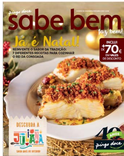
Figure 1. Sabe Bem 58 th issue cover

Particularly, this article points to a reconfiguration in the cultural text of this communicational support, which starts to amplify nationalist discourses and summons consumers to a new behavioral program, connecting consumption to a patriotic spirit. More specifically, this magazine presents itself as a telescope to closely observe the current advertising policies of a company, which has a relevant influence in the Portuguese public sphere, as it stands out as the largest enterprise regarding food in the country, in a time of fragility, due to the pandemic caused by COVID-19.