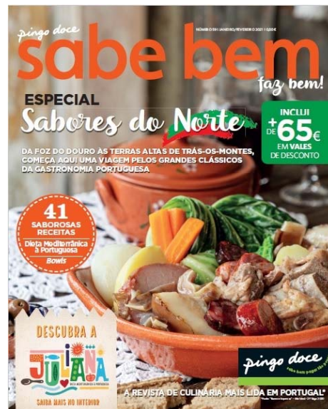
Figure 5. Sabe Bem 59 th issue cover