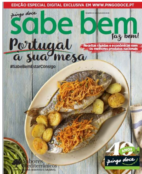
Figure 4. Sabe Bem 55 th issue cover